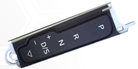
Plastic Night/Day Style