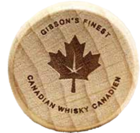
Wood Bottle Cork