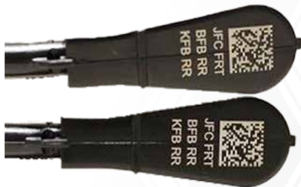
Black POM Plastic Connectors