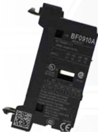
Black Circuit Breaker