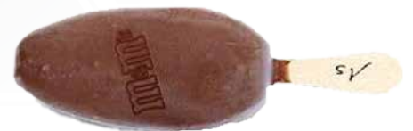
Chocolate Ice-Cream Treat