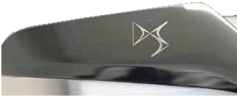
Logo on Car Doorhandle