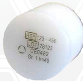
Medical Plastic Implant