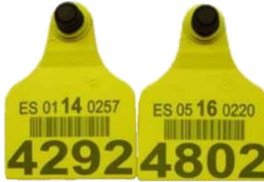
TPU Plastic Cattle Ear Tags